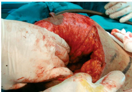
Fig. (4): Turnover the flap.