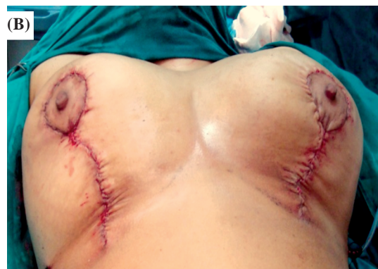
Fig. (6): Closure of the skin and areola (A: Small inverted T closure, B: Vertical limb closure).