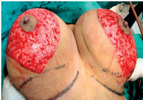
Fig. (2): De-epithelialization.